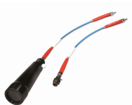
Figure 2. Collimating lenses screw on to the end of SMA 905-terminated optical fibers. The lens at left is best for applications that require collimation of light at long distances in open air.

Ocean Insight collimating lenses can be used in free space optics, in which light energy is collected from open beams and surfaces and directed to the spectrometer, or can be attached to optical fibers ( Figure 2 ) or integrated into sampling accessories. Most lenses have an inner barrel threaded for SMA