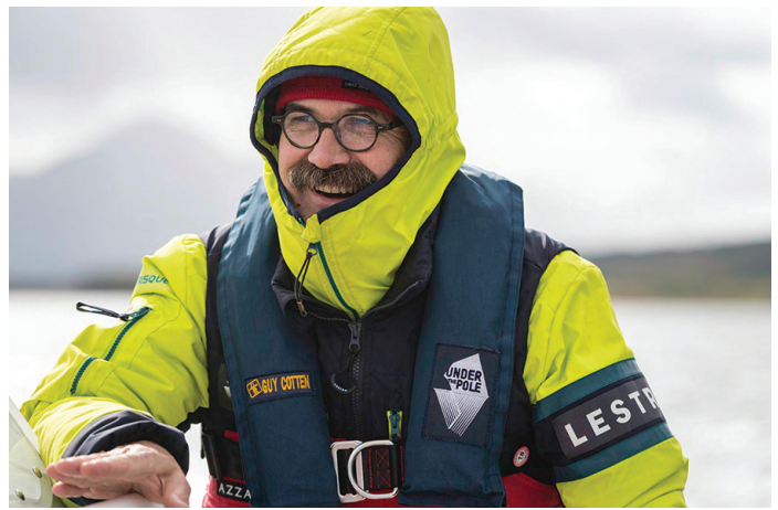
Figure 1. Dr. Marcel Koken's work as part of the Under The Pole III expedition allowed him to characterize bioluminescent and fluorescent proteins in Arctic Ocean organisms.

On the other hand, fluorescence is a purely physical phenomenon not needing any living entity! Light is emitted from a sample after being excited with photons of higher energy (and thus lower wavelength). On living animals harboring fluorescent patterns these are mainly used for intra-species communication and signaling toward predators and prey. For instance, in common budgies [parakeet species native to Australia], it isn't the green color that attracts the females to the male coat, but the violet and yellow fluorescent spots (invisible to the naked human eye) that are rendered visible to the female by the sun's deep blue and ultraviolet light.