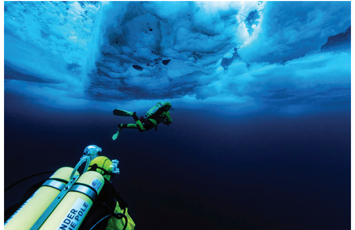
Figure 2. Under The Pole's divers collected specimens from as deep as 100 meters, without adversely affecting the bioluminescent properties of the animals.

Underwater, organisms were illuminated with Keldan® LED dive lamps emitting either at 405 nm (LED module: UV) or at 450 nm (LED module: Blue). Excitation light was blocked with a yellow filter (Altuglas PMMA polycarbonate) in front of the divers' masks or the camera lenses to easily discern the fluorescence and to not be hindered by the blue halo of the lamps.