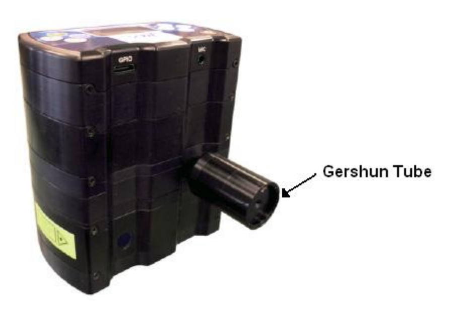
Jaz Stack Spectrometer Module with Gershun Tube Attached

We attach a Gershun Tube Kit (GER-KIT) to the SMA 905 entrance aperture of the spectrometer in the Jaz stack. The GER-KIT allows control the field of view of the spectrometer from 1° to 28°. The GER-KIT is a versatile tool that can be used with fibers or directly attached to the spectrometer. The GER-KIT is priced separately.