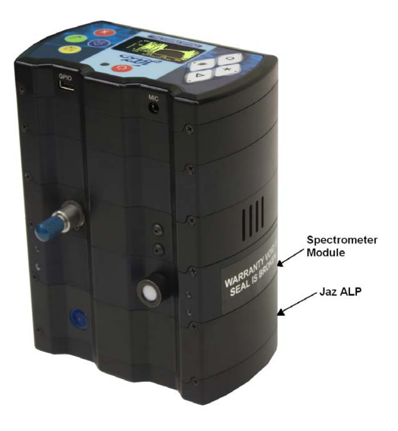
Jaz ALP in a Jaz Stack

We add the Jaz-ALP to the Jaz stack, directly below the spectrometer module. The low-power laser pointer operates from three AAA batteries, so no additional power is required. The laser is a Class II 650nm red laser, so proper safety precautions must be followed.