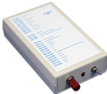
KR-1 Krypton Calibration Light Source

The following sections detail the features of the KR-1 Krypton Calibration Light Sources.