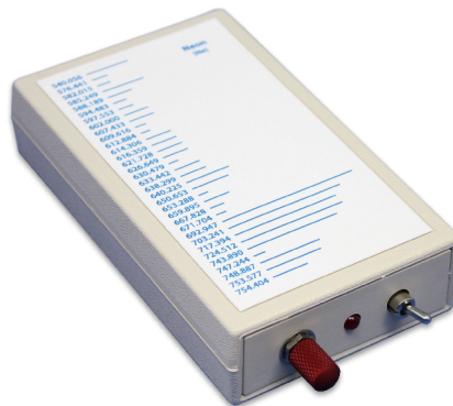
XE-1 Xenon Calibration Light Source

The following sections detail the features of the XE-1 Xenon Calibration Light Sources.